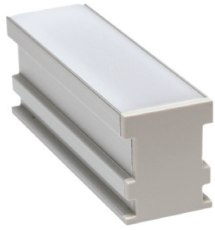
shown with closed end cap